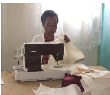
Plate 5: A Student Stitching With a Sewing Machine during a Pattern Drafting Class at Maseno University

From the field observation, most sewing machines were not in good condition in UoE and Maseno University UFAD departments. The sewing machines were mostly old and treadle except for KU that had several current electric machines. Plate 5 shows a student in a pattern drafting class stitching with a sewing machine.