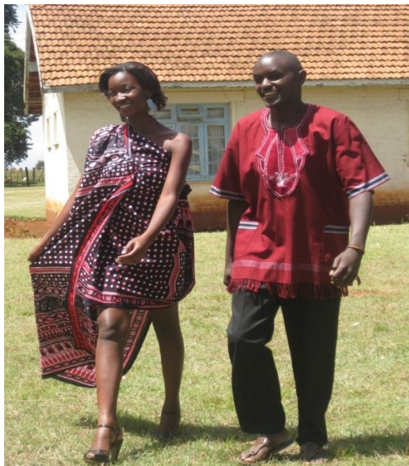
Plate 4: Students of UoE in a Cat Walk of Cultural Dress

At UEAB FAD department, students' practical projects were never checked by an external examiner; they were given back to the students once they had been marked. This implies that the evaluation of the standards for the practical area, which is crucial to acquisition of FAD skills, was not assessed by the external examiner in this department.