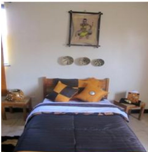
Plate 1: An Exhibition of Multimedia Projects at Egerton University

Plates 2 shows a student from Kenyatta University wearing their designed costume during an evaluation while plates 3 and 4 illustrates UoE students modelling their projects in a fashion show organized at the end of the semester..