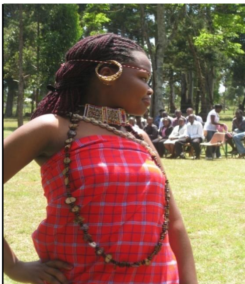
Plate 3: A Student Showing her Designed Maasai Attire