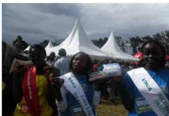
Plate 6: FAD Students from UoE Modelling during a Trade Fair

UFAD programs were marketed by advertising on daily newspapers, brochures and pamphlets to catchment areas like secondary schools and through industrial attachments, participating in university exhibitions, trade fairs and shows including road shows. Plate 6 shows FAD students from UoE modelling as a marketing tool for Unga Ltd. Products during a trade fair at the university premises.