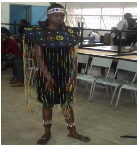
Plate 2: A Show of Performance Costume by a Student at Kenyatta University

Plates 2 shows a student from Kenyatta University wearing their designed costume during an evaluation while plates 3 and 4 illustrates UoE students modelling their projects in a fashion show organized at the end of the semester..